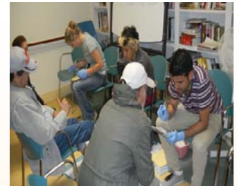
Podiatric Clinic run by HealthCorps members

Professional continuing education is provided for member clinic clinicians and staff. Topics include patient centered medical/health homes, interprofessional team care, communications skills, and chronic disease management. Clinic support staff receive targeted skills improvement training through local training partnerships.