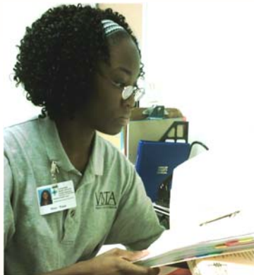
HealthCorps member conducting health education in CHC

The AHEC also supports the Community HealthCorps program at SFCCC. Members are committed to a year-long service learning program, working as outreach and health educators in member clinics, shadowing health professionals in clinics and on the homeless van and helping the outreach and education tasks for Covered California. A majority of the members go on to be trained as health professionals and are interested in working with the clinic and health center-served populations.